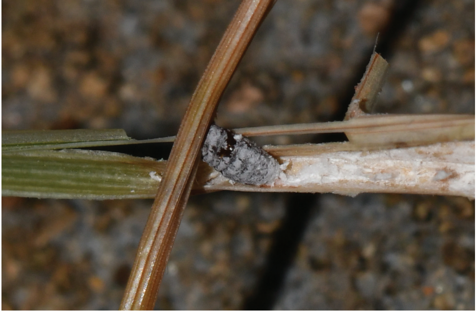
Figure 1. Habitus photograph of Atrococcus rushuiensis sp. nov. under the leaf sheath of Sporobolus fertilis (Poaceae).

267.5–289 \mu\text{m} long, lengths of each segment: I 42.5–52.5, II 37.5–38.8, III 23.8–27.5, IV 18.8–22.5, V 17.5–23.8, VI 20–26.3, VII 28.8–32.5 and VIII 65–76.3 \mu\text{m} . Eye spot located at body margin lateral to antennal base. Legs well developed; hind coxa 52.5–65 \mu\text{m} long, hind trochanter + femur 185–215 \mu\text{m} long, hind tibia + tarsus 198.8–240 \mu\text{m} long; claw 17.5–22.5 \mu\text{m} long, both tarsal digitules and claw digitules knobbed, longer than claw. Ratio of lengths of hind tibia + tarsus to hind trochanter + femur 1.07–1.14:1. Ratio of lengths of hind tibia to tarsus 1.49–1.69:1. Translucent pores present, minute duct-like, present on anterior and posterior surface of hind coxa. Circulus absent. Clypeolabral shield 125–145 \mu\text{m} long. Labium with three segments, 62.5–70 \mu\text{m} long. Ostioles moderately developed, each lip with 4–13 trilobular pores and 0–2 short setae. Anal ring normal, 61.3–70 \mu\text{m} in diameter, bearing six long setae, each seta 82.5–103.8 \mu\text{m} long. Cerarii numbering a single pair on anal lobes only. Anal lobe cerarii ( C_{18} ) each containing two slender conical setae, each seta 18–21 \mu\text{m} long, with 2–3 auxiliary setae, and 4–5 trilobular pores near conical setae base, all situated on a membranous area.