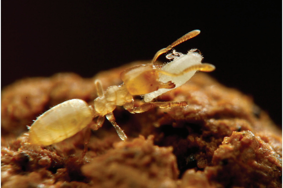
Figure 2. An adult female of Ishigakiccoccus shimadai sp. n. being carried by Acropyga yaeyamensis .

setose setae, 10.5–37.4 µm long, each with a pointed apex. Both setae distributed in transverse segmental bands. Multilocular pores each about 2.9–3.7 µm in diameter, each with 5–6 loculi, frequently present and evenly distributed on all areas of venter. 3–5 locular pores, each 5.8–7.9 µm in diameter, without central hub, present on medial area of abdominal segments III–VI in transverse rows. A circulus, 10.5–18.4 µm long and 21.0–33.2µm wide present on medial anterior border of abdominal segment II. Tritubular and bitubular pores absent. Oral collar tubular ducts absent.