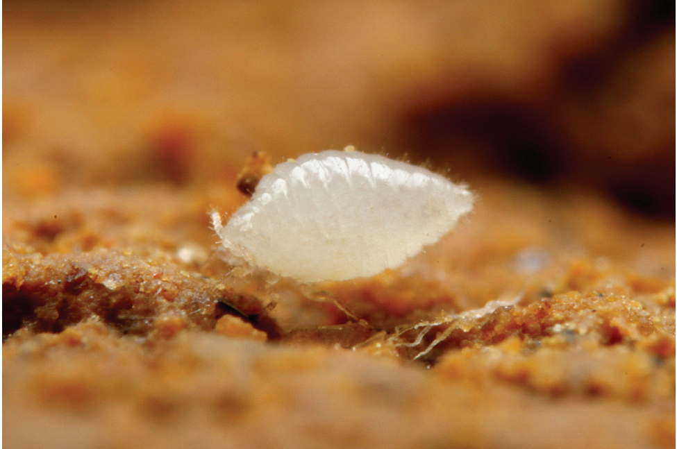
Figure 1. A mature adult female of Ishigakicoccus shimadai sp. n.

Slide-mounted specimens. Body elongate oval, slightly pyriform, 721–895 \mu\text{m} long, 379–632 \mu\text{m} wide. Eye spot absent. Antennae 5 segmented, 1 st : 18.4–29.5 \mu\text{m} long, 2 nd : 13.7–18.4 \mu\text{m} long, 3 rd : 15.8–26.3 \mu\text{m} long, 4 th : 17.1–22.1 \mu\text{m} long and 5 th : 36.8–41.3 \mu\text{m} long. The fifth segment with three fleshy setae. Anterior spiracles each 20.8–28.7 \mu\text{m} wide across atrium; posterior spiracles each 16.8–29.7 \mu\text{m} wide across atrium. Legs well developed, length of posterior pair: coxa 45.8–55.2 \mu\text{m} long, trochanter + femur 123–133 \mu\text{m} long, tibia + tarsus 112–122 \mu\text{m} long, claw 33.4–39.4 \mu\text{m} long. Ratio of lengths of tibia + tarsus to trochanter + femur 1.05–1.11. Claw digitules setose, each 3.2–6.1 \mu\text{m} long.