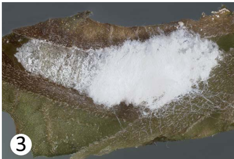
Figure 3. Adult female Phenacoccus multicerarii with ovisac on a leaf.