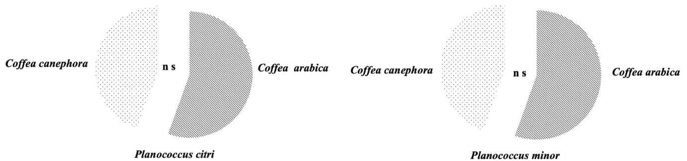
Figure 2: Relative permanence (%) of 1 st instar nymphs of Planococcus citri and Planococcus minor in olfactometry test (Student values p=0.4559 , n=20 and p=0.4117 , n=24 , respectively). Data analyzed with arcsine transformation \sqrt{x}/100 , n =number of insects that responded to odors.

Development and reproduction were favored in Conilon coffee, agreeing with the results obtained in the free choice test. These results indicate that, in this plant, mealybugs are capable of forming larger colonies, which seems to agree with a situation found in the field.