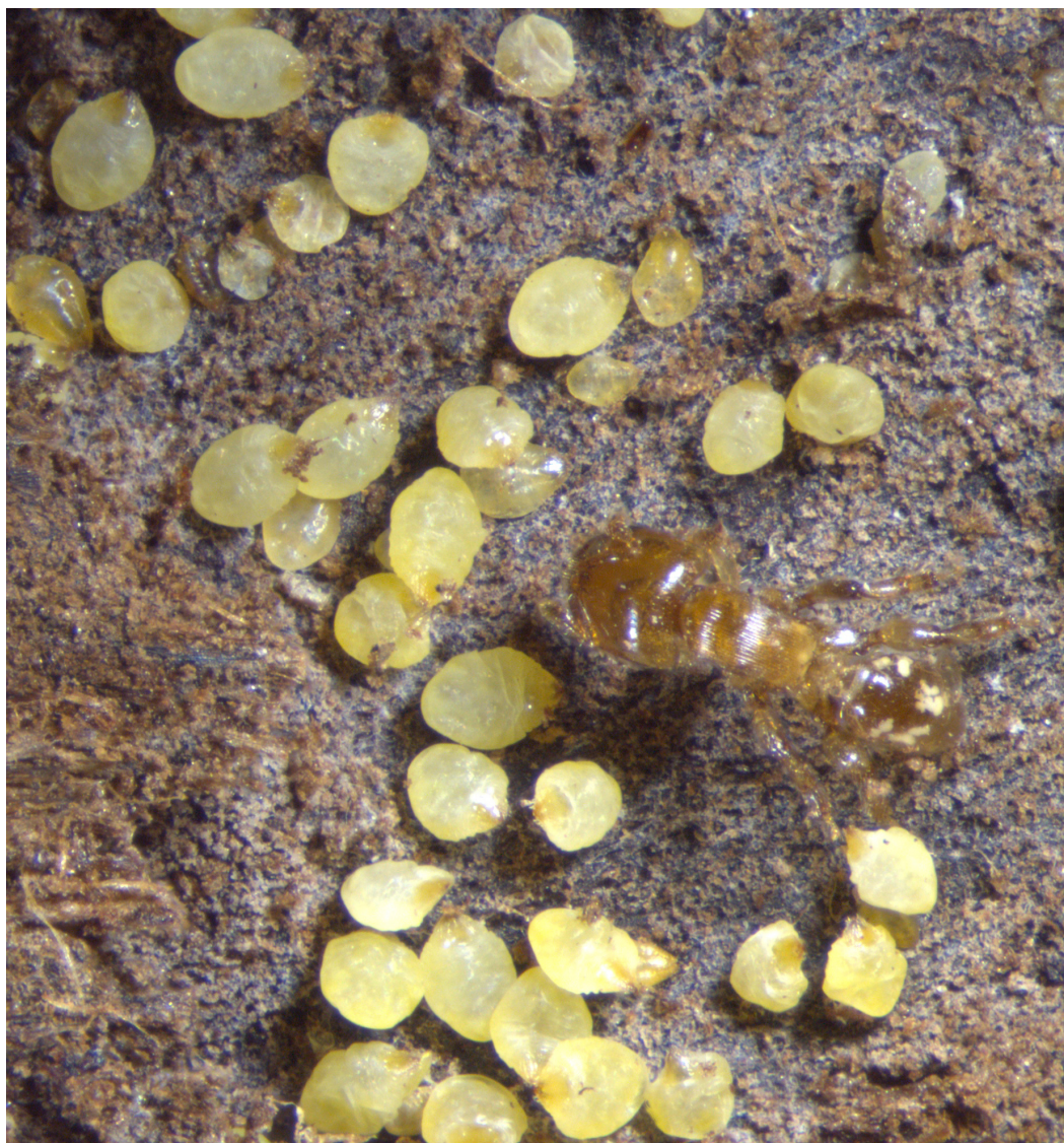
Figure 2 Aggregation of female Morganella conspicua and a worker (2.5 mm long) of Melissotarsus emeryi .

within 24 hours, or they will die of exhaustion. Once settled, crawlers insert their stylets and start to feed, then molt into second instars and lose their legs; after this, they can never move again. Several aggregations included a range of body sizes (Fig. 2). We removed 32 fully-grown adult females from one aggregation (after several weeks in the laboratory), revealing 59 smaller diaspidids (crawlers and second instars) underneath.