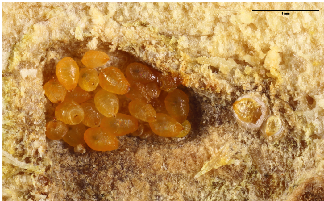
Figure 4 Shield-less adults of Morganella conspicua , and two shields (on right) away from the aggregation.