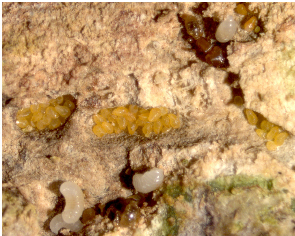
Figure 1 Dense aggregations of adult Morganella conspicua , ant workers and scattered ant larvae.