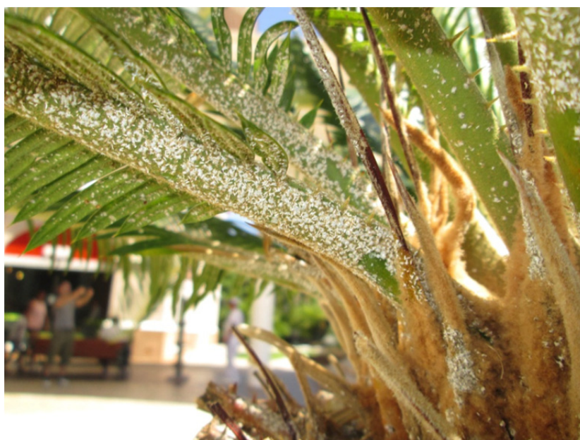
Figure 3. A typical dense infestation of Cycad Aulacaspis Scale on Cycas revoluta Thunb., 1782, showing a conspicuous white incrustation of scale covers.

Campeche, and Guatemala City, and we have received photographically documented reports of infestations in Jalisco, Morelos, Guerrero, and Quintana Roo. Details of all the documented infestations are given in Table 2 and locations are shown by the filled black and gray stars on Figure 1. Most of the hosts are introduced species of Cycas , but at one locality a native Mexican species, Dioon merolae De Luca, Sabato & Vázq. Torres, 1981, is also infested. All of