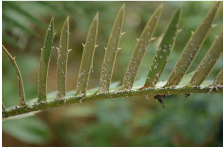
Figure 4. Cycad Aulacaspis Scale infestation on Dioon merolae in the Tuxtla Gutiérrez Botanical Garden, Chiapas, Mexico. D. merolae is endemic to the states of Chiapas and Oaxaca. Natural populations of D. merolae within 70 km of this botanical garden are still free of Cycad Aulacaspis Scale.