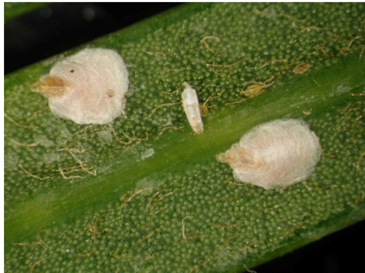
Figure 2. A close-up of 2 Cycad Aulacaspis Scale females and 1 male. The female scales are on either side, showing the broad white scale cover and the exuviae (shed cuticles of the immature instars) on the left margin of each scale cover. The smaller male is between them.