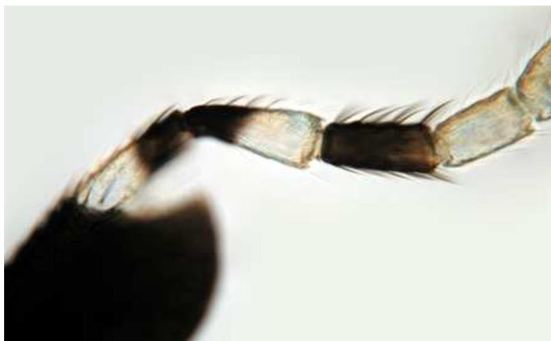
Fig. 3. Detail of Anagyrus sp. near pseudococci antenna (x 40).

All collected parasitoid specimens (twenty one) were identified as Anagyrus sp. near pseudococci sensu Triapitsyn et al. (28). Indeed, the females of this species have the first antennal funicular segment entirely black while in A. pseudococci the same segment is half or 2/3 black and the rest white (Fig. 3).