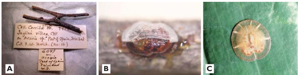
Fig. 1. A. Dry insects and twigs with original labels; B. Close-up of one dry adult female showing half of glassy covering removed; C. I. vitrea on leaf of greenhouse plant (Araliaceae), Brazil. (A and B: Type material of I. vitrea Cockerell, housed in USNM; photos by T. Kondo).

Unmounted material (Fig. 1). Cockerell (1894) wrote of the adult female in life: “On Acacia sp., Port-of-Spain (Urich). 3 mm. long, 1½ wide, oval, moderately convex. Glassy scale white, with a conspicuous median longitudinal ridge; posterior cleft large,