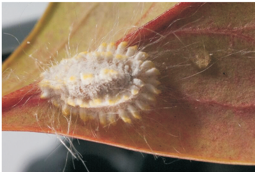
Fig. 1. Adult female of Icerya seychellarum on dwarf Nandina domestica (Berberidaceae).

it has become economically important on mango (Salem et al. 2006), apple (Mangoud 2008) and grape vines (Mangoud 2010). It has also been reported as a pest of guava and citrus in Fiji (Lever 1946) and killing citrus trees in Vanautu, an island in the South Pacific Ocean (Williams & Butcher 1987). As a phloem-feeding, honeydew-secreting insect occurring on valuable crops, I. seychellarum therefore has the potential of being of considerable economic importance. Newberry (1980) found that the species can significantly reduce plant growth.