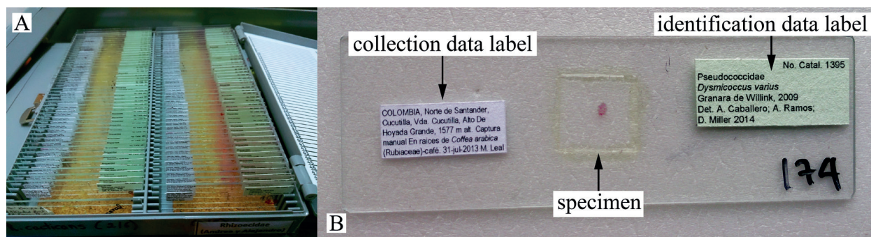
Fig. 1. A. Slide holder with samples curated. B. Slide of a curated sample, showing the arrangement of collection and identification data labels and specimen.

The first scale insect slides were made using different protocols, such as those standardized by Williams & Granara de Willink (1992) and the Systematic Entomology Laboratory (2015), U.S. Department of Agriculture, Beltsville, MD, U.S.A. Since 2016, SIC-UNAB has switched to a modification of the method established by Sirisena et al. (2013), as the process is faster and avoids the use of some carcinogenic compounds (xylene and phenol). All samples are preserved as permanent slide-mounts in Canada balsam.