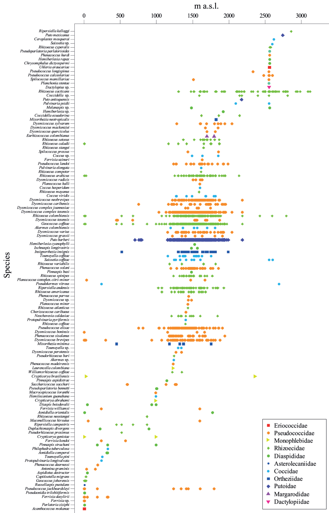
Fig. 3. Altimetry graphic with range by species given in meters about sea level (m a.s.l.). Each point indicates one sample. Color and shape indicate taxonomic family.